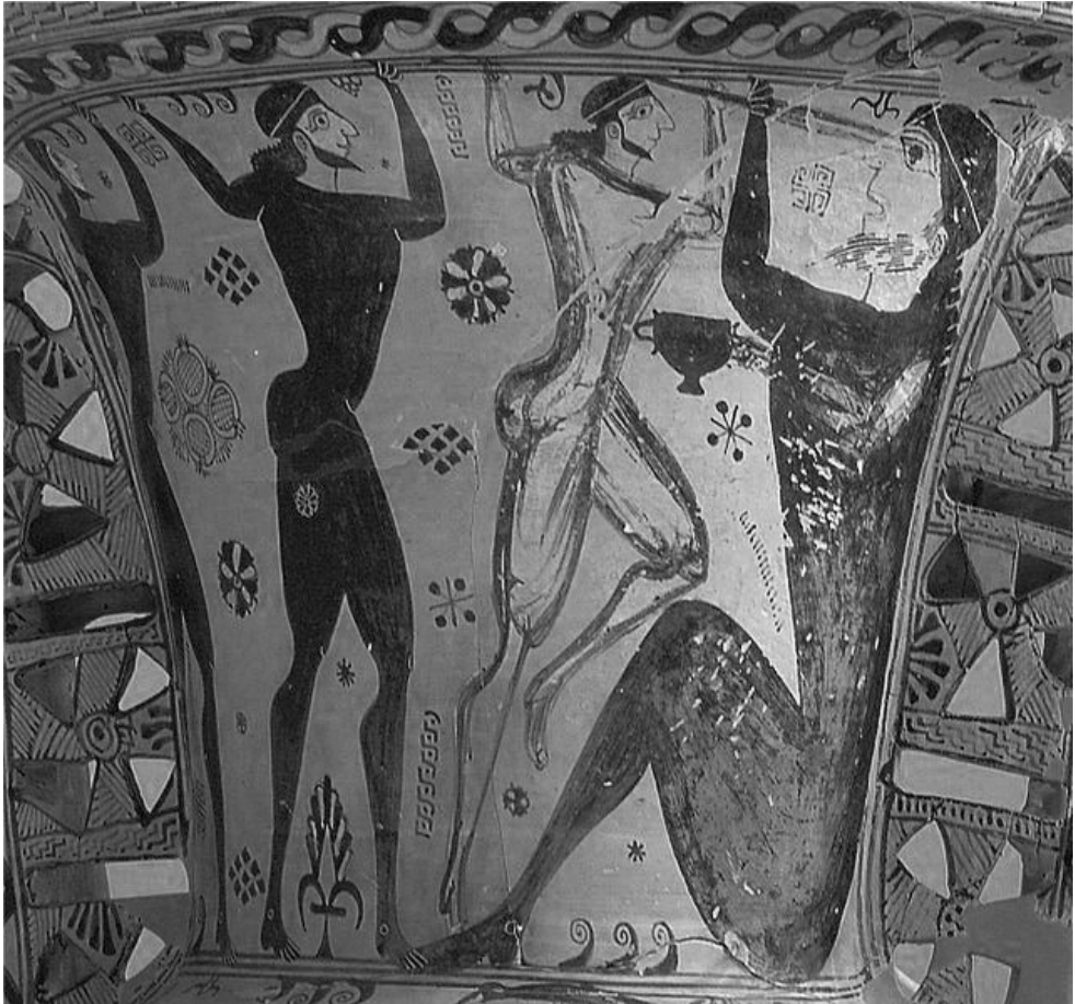
Figure 2 – The blinding of the Cyclops Polyphemus by Ulysses. Funerary Proto-Attic Amphora (670-660 BC). Archaeological Museum of Eleusis.

Cyclops, though he is naive, is aware of the Trojan War and becomes sarcastic at Ulysses when discussing the war with him. Euripides, more precisely than Homer, believes that the island where Cyclops was found by Ulysses was Sicily and mentions that the cave where he lived was in the famous volcano of Etna. In general, the Greek tragedian does not alter the plot of the myth, but the cause for Polyphemus's blinding. The moral of his satirical drama is the triumph of human intelligence, as represented by Ulysses, over savagery and illiteracy.